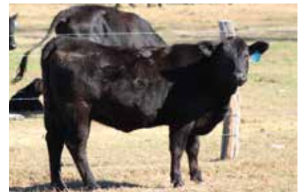
Sire: 889B78 Dam: 250 DOB: 11-7-19