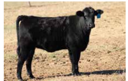
Sire: 784B Dam: 342 DOB: 2-15-19