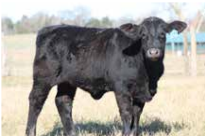
Sire: 7B Dam: 173D DOB: 1-3-19