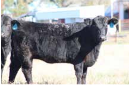
Sire: 333B6 Dam: 96 DOB:11-24-18