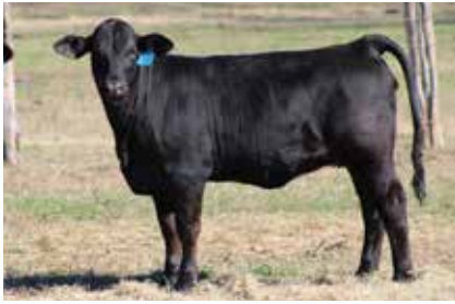
Sire: 924B28 Dam: 400 DOB: 1-9-19