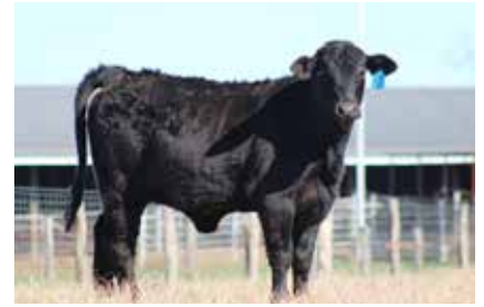
Sire: 000C46 Dam: 599 DOB: 3-6-19