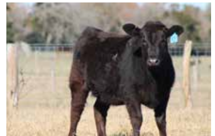
Sire: 000C46 Dam: 547 DOB: 2-2-19