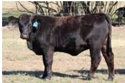
Sire: 889B78 Dam: 248 DOB: 11-21-18