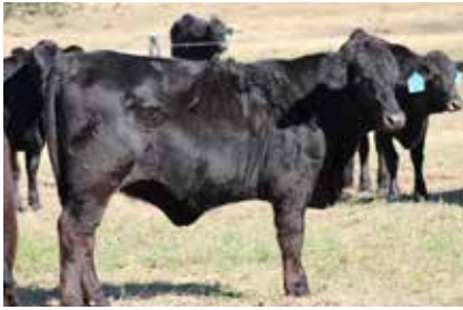
Sire: 333B6 Dam: 11 DOB: 12-11-18