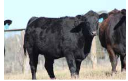
Sire: 889B50 Dam: 7/0 DOB: 11-20-18