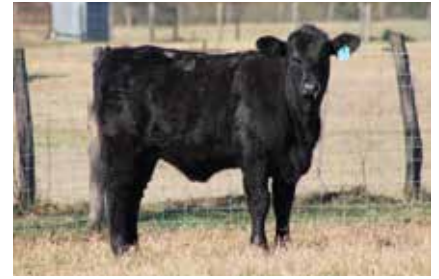
Sire: 000C46 Dam: 539 DOB: 12-16-18