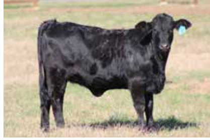
Sire: 889B86 Dam: 122 DOB: 2-5-19