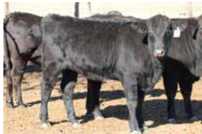
Sire: 7B Dam: 142D DOB: 12-15-18