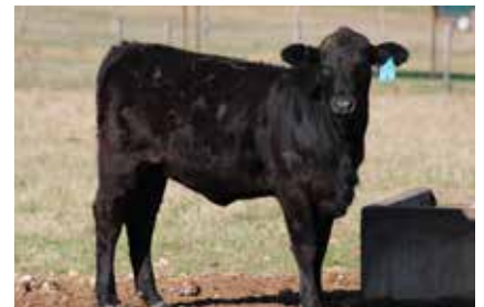
Sire: 889B51 Dam: 179 DOB: 2-19-19