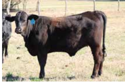
Sire: 889B86 Dam: 171 DOB: 1-3-19