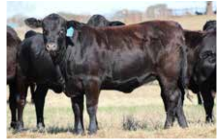
Sire: 889B50 Dam: 359 DOB: 11-23-18