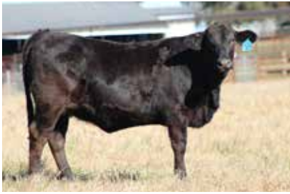
Sire: 889B86 Dam: 422 DOB:1-17-19