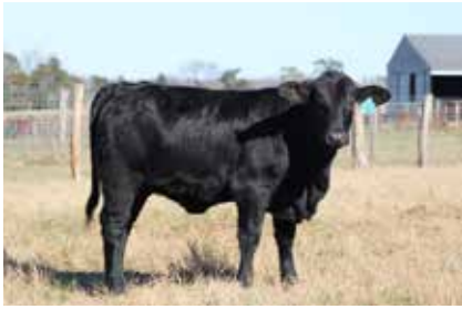
Sire: 19B Dam: 162 DOB: 1-8-19