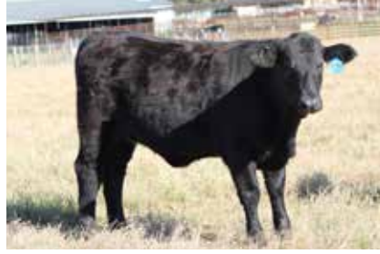
Sire: 000C46 Dam: 504 DOB:12-17-18