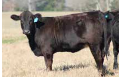
Sire: 889B78 Dam: 172 DOB:11-12-18