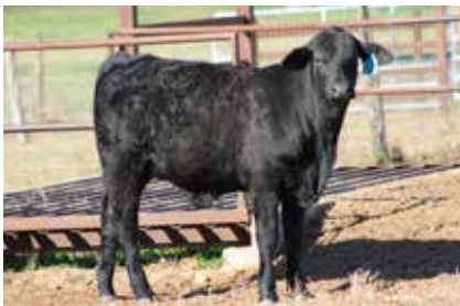
Sire: 889B50 Dam: 331 DOB: 3-12-19