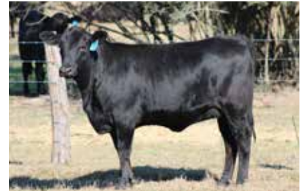
Sire: 000C Dam: 167 DOB: 12-2-18