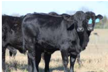
Sire: 000C46 Dam: 543 DOB: 1-15-19