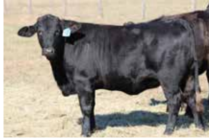
Sire: 129C11 Dam: 403 DOB: 12-6-18