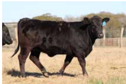
Sire: 000C46 Dam: 545 DOB: 12-26-18