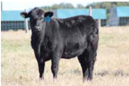
Sire: 000C46 Dam: 557 DOB: 12-15-18