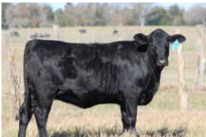
Sire: 889B50 Dam: 343 DOB: 11-21-18